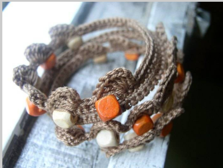
Photo 2: The Rustic Version of the bracelet use alternating colors of wood beads. Experiment with beads and color!