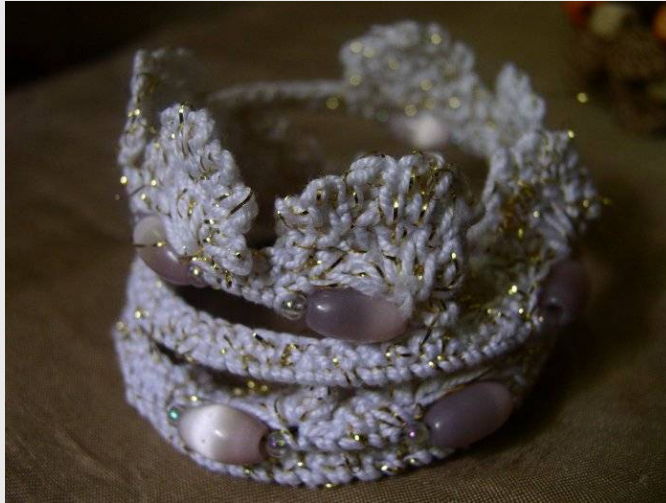
Photo 3: The Glitter Version of the bracelet has a round of picots along the scallops and uses tiny seed glass beads.