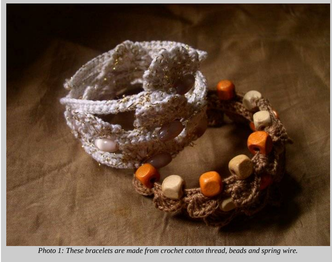
Photo 1: These bracelets are made from crochet cotton thread, beads and spring wire.

by Fatima Lasay ( fats@crochetology.net )