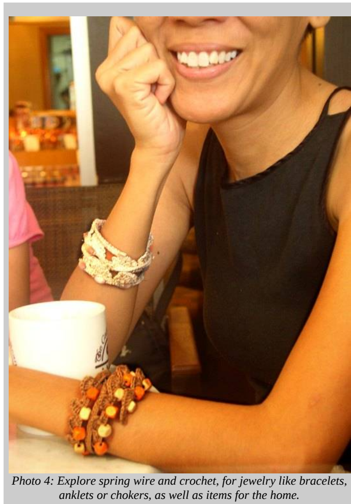
Photo 4: Explore spring wire and crochet, for jewelry like bracelets, anklets or chokers, as well as items for the home.

Tip: Change the number and order of beads to your liking. Add more sc's between beads or have less sc's and more beads. Experiment and explore.